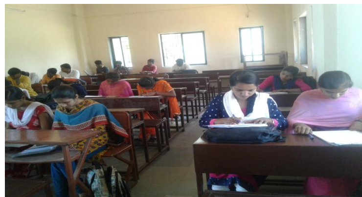
Exam appeared students