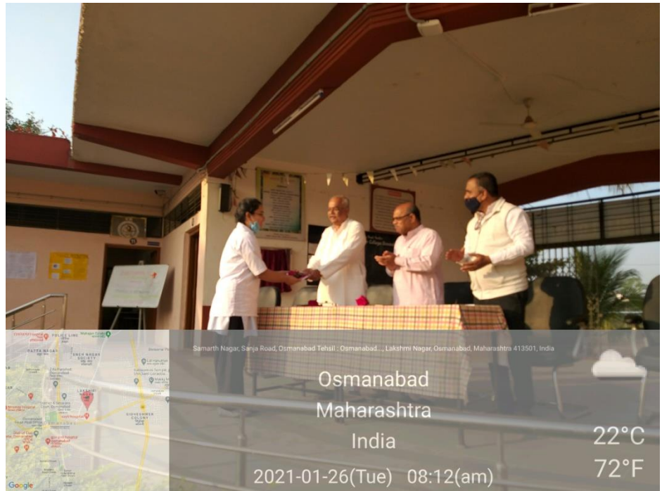
Students taking prizes in ceremony of Republic Day

Department has organized Ppt. making competition for Bsc II nd year student on the occasion of “ World Soil Day-5 Dec ”there are 20 student participated .in this competition . First ,Second And third Prize are drawn .and prize are distributed on the occasion of 26 Jan