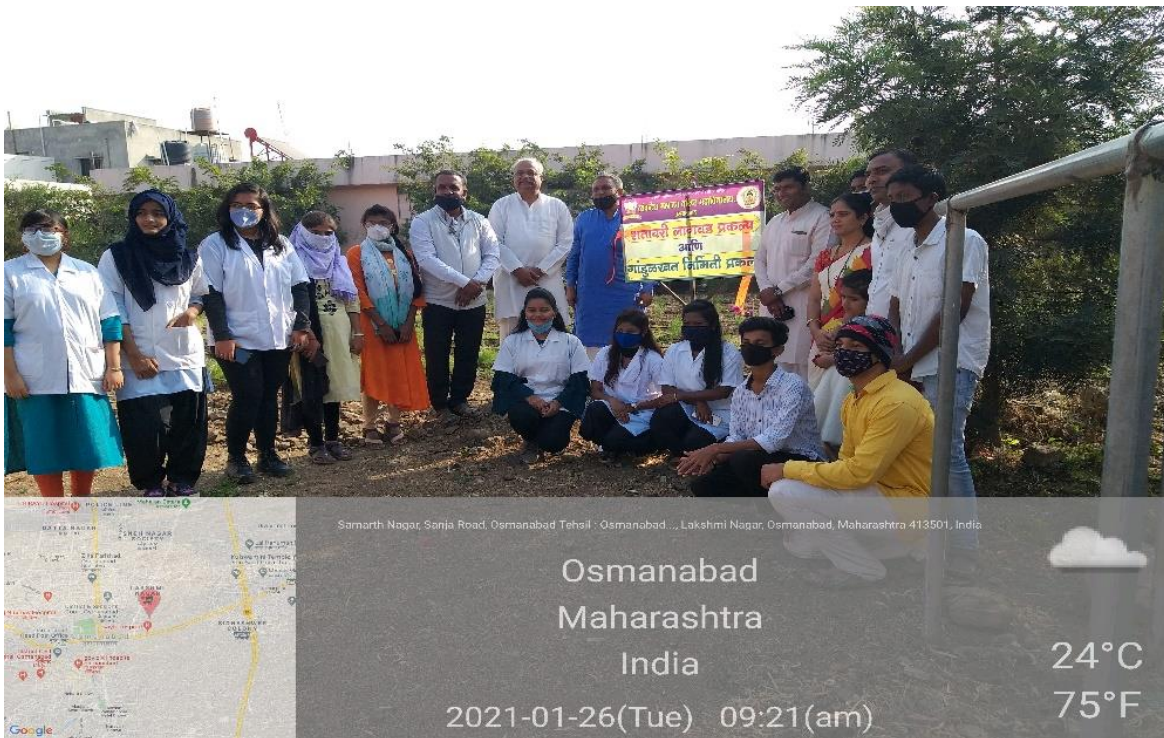
Inauguration of Shatavariculture and Vermicomposting