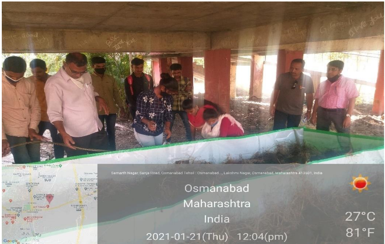
Student and teacher working in vermicomposting

All the two project conducted under “ Earn and Learn “ scheme there are 8 student are enrolled into this scheme.