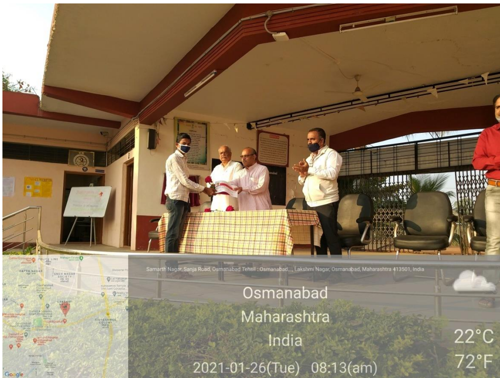
Students taking prizes in ceremony of Republic Day