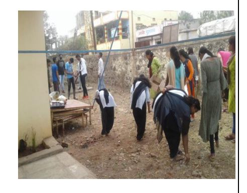
Cleanness of 93 Marathi Sahitya Sammelan Office