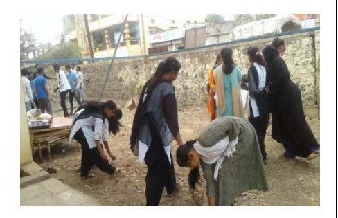
Cleanness of City Chawk and Place of 93 Marathi Sahitya Sammelan