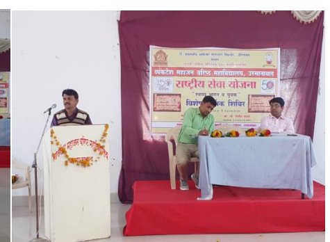
Guidance and Group disscussion of Guest