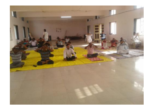
ANTI TOBACCO DAY