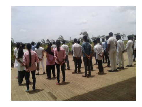
SWACCH BHRAT ABHIYAN