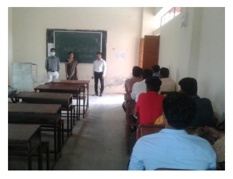
HIV AWRENESS CAMP