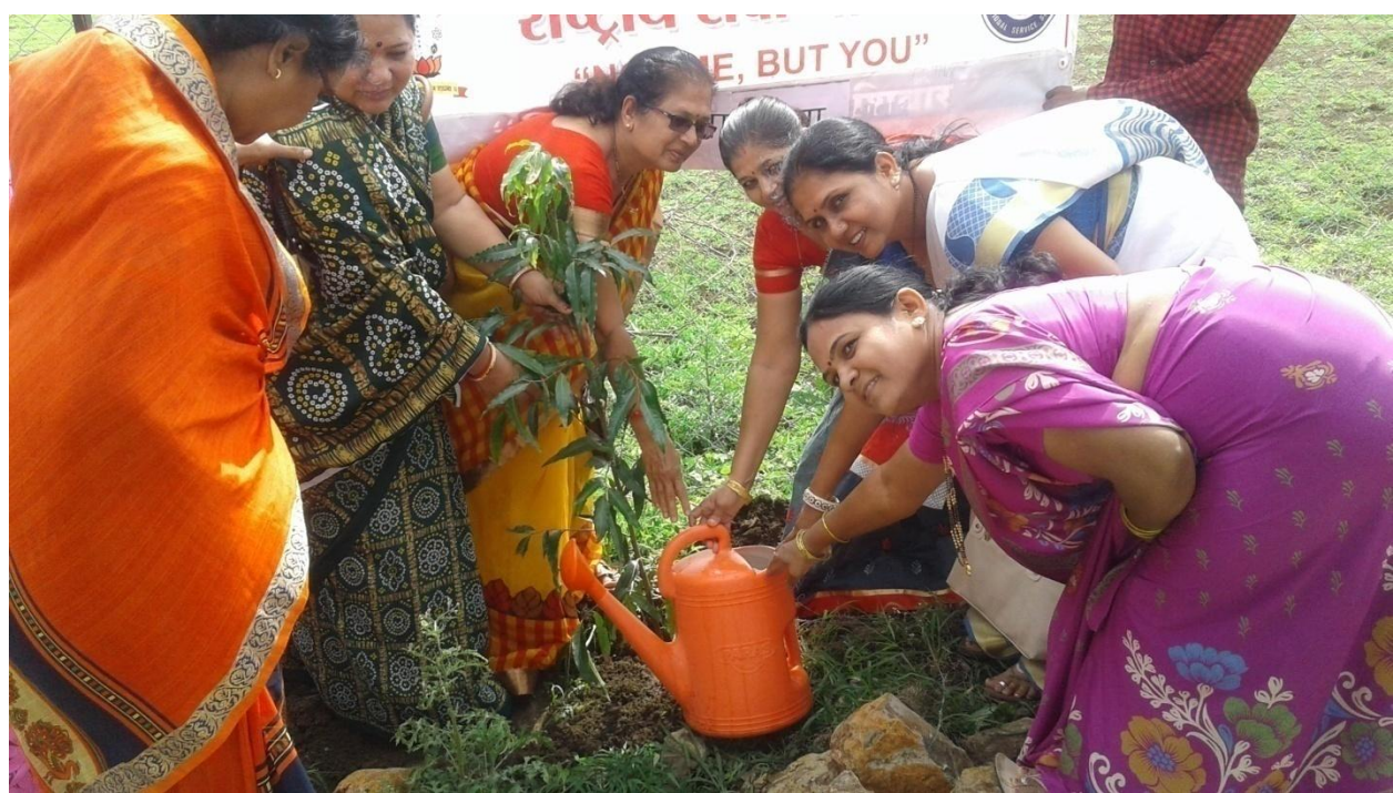
Tree plantation by Dharasur mardini mahila federation and college staff