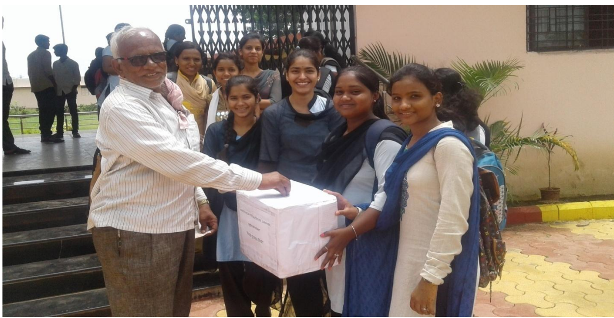
Kerala Flood donation rally by student and staff