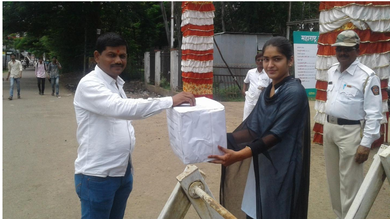
Kerala Flood donation rally by student and staff