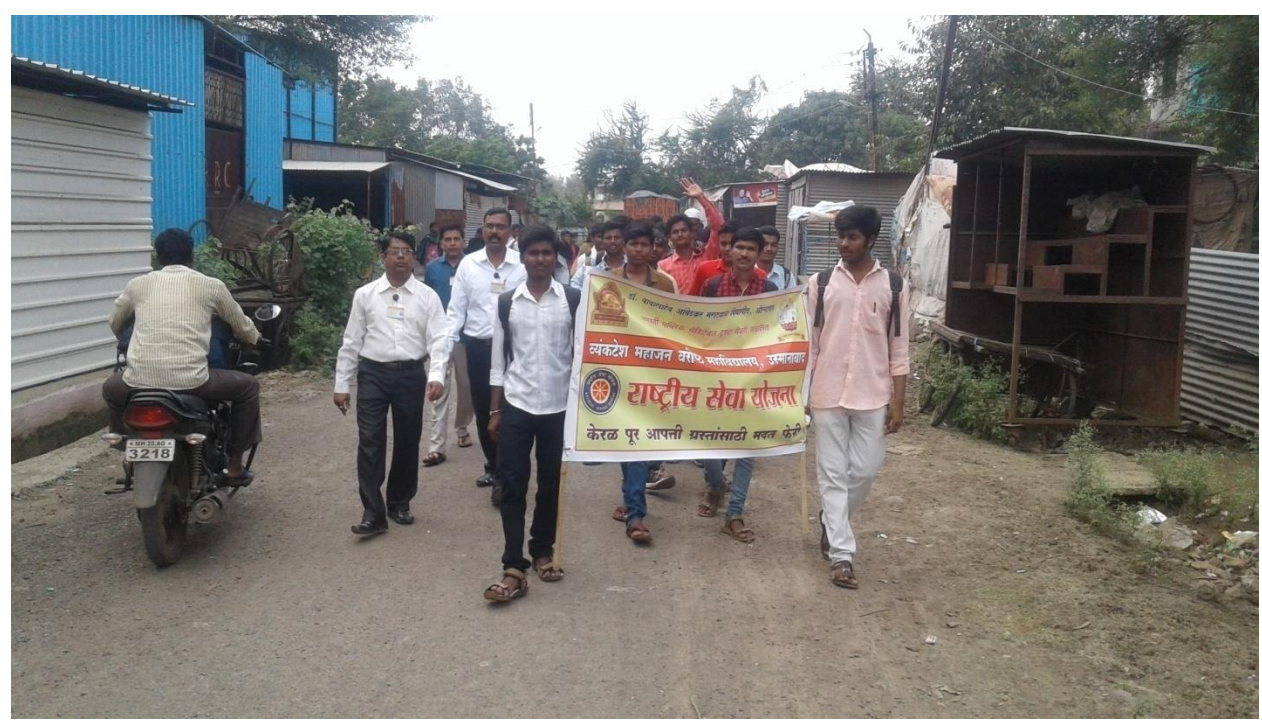
Kerala Flood donation rally by student and staff