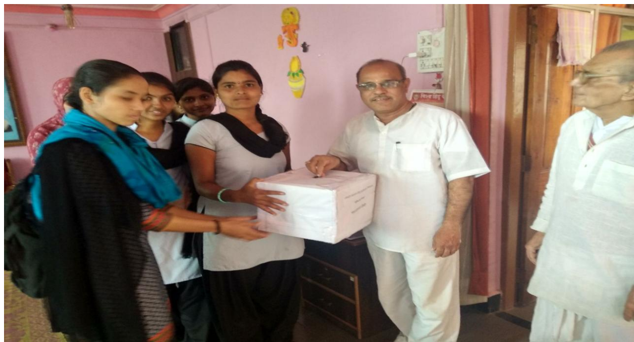
Kerala Flood donation rally by student and staff