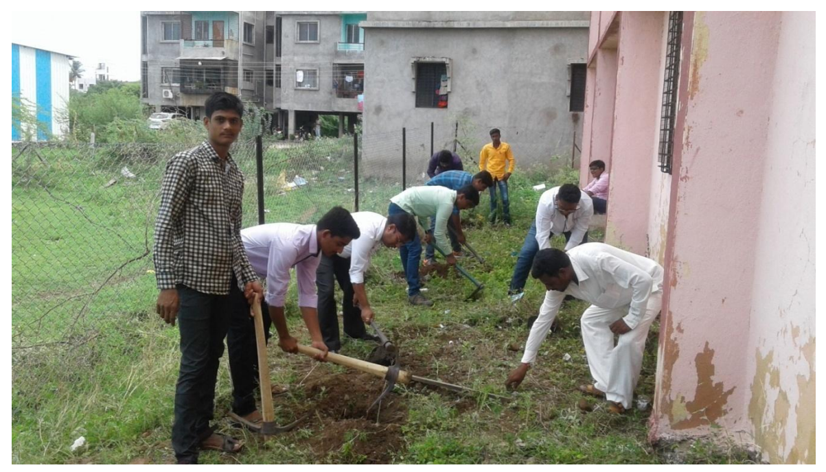
Making pits by students and staff members