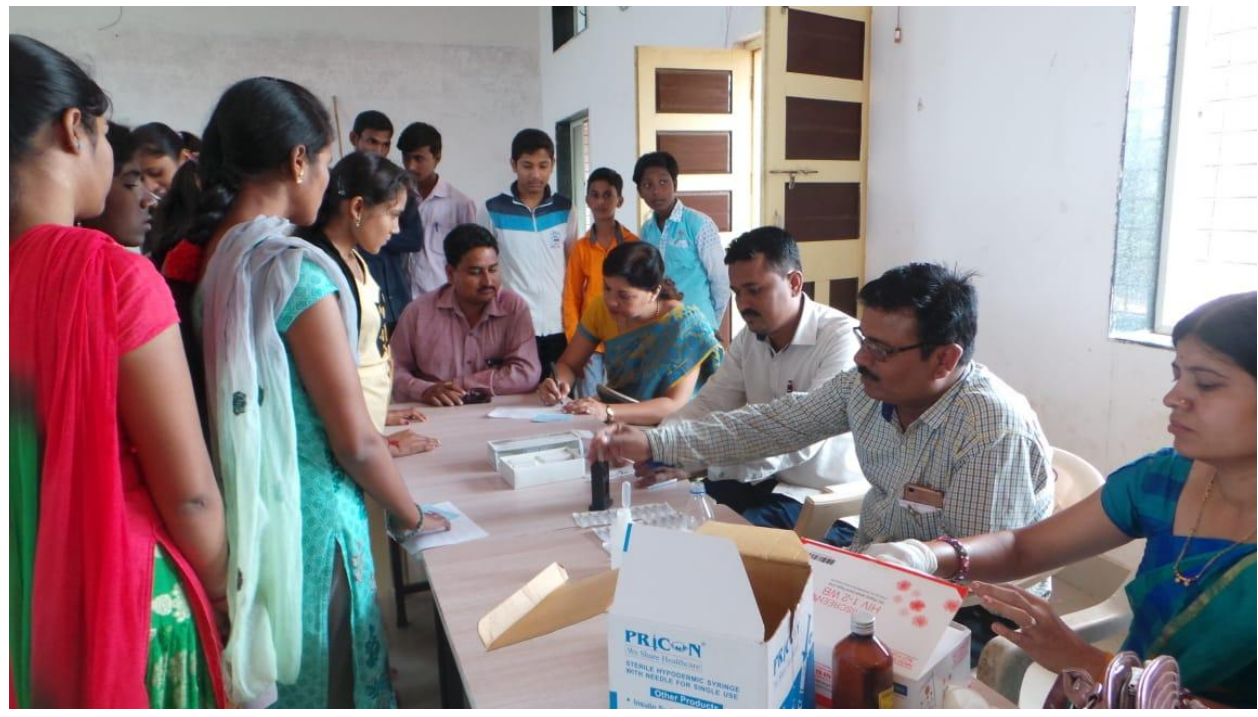
Health Checkup camp