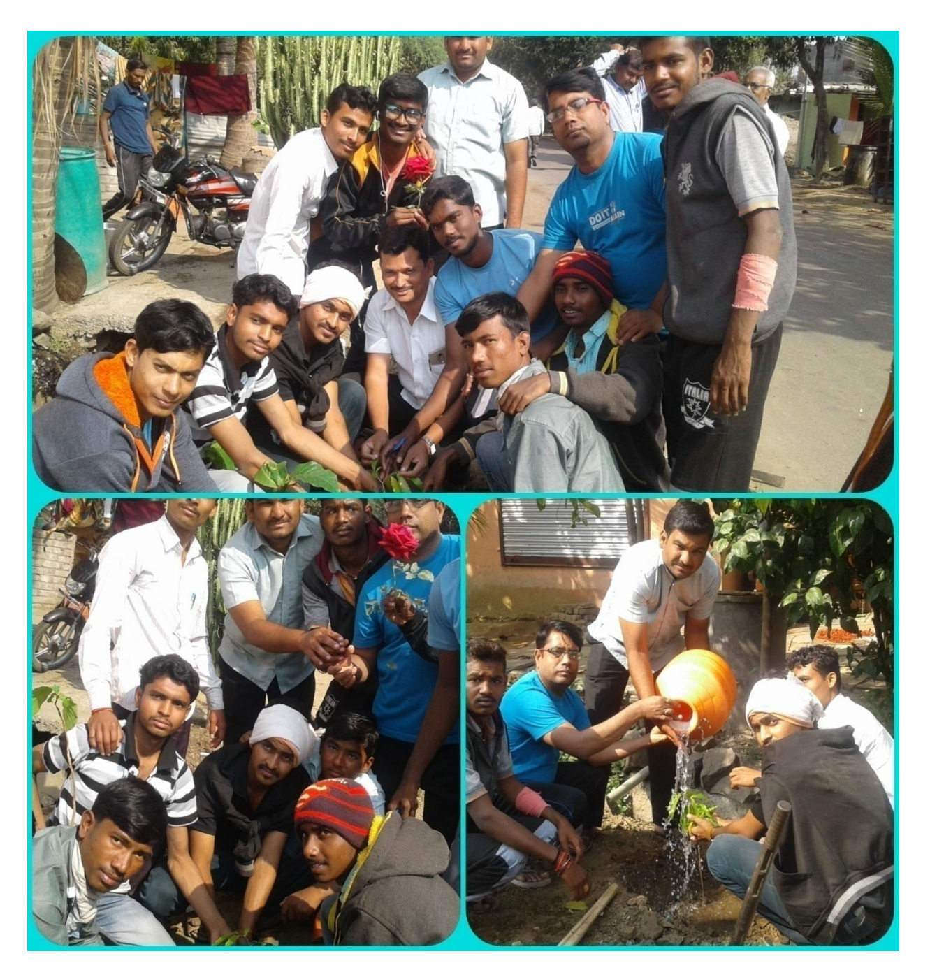
Tree Plantation by students, staff and villagers