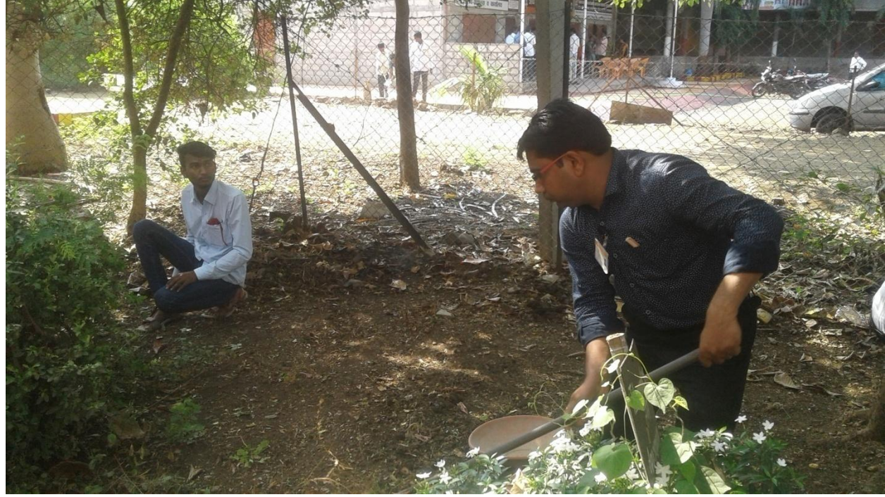
Cleaning Campus by students and staff