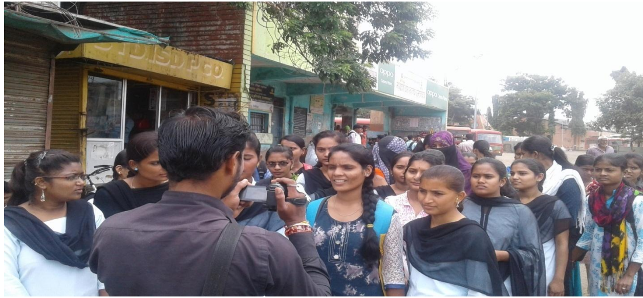
Kerala Flood donation rally by student and staff