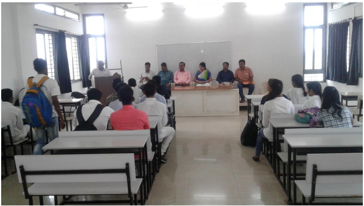
SRD/NRD Selection Camp –participated Volunteers