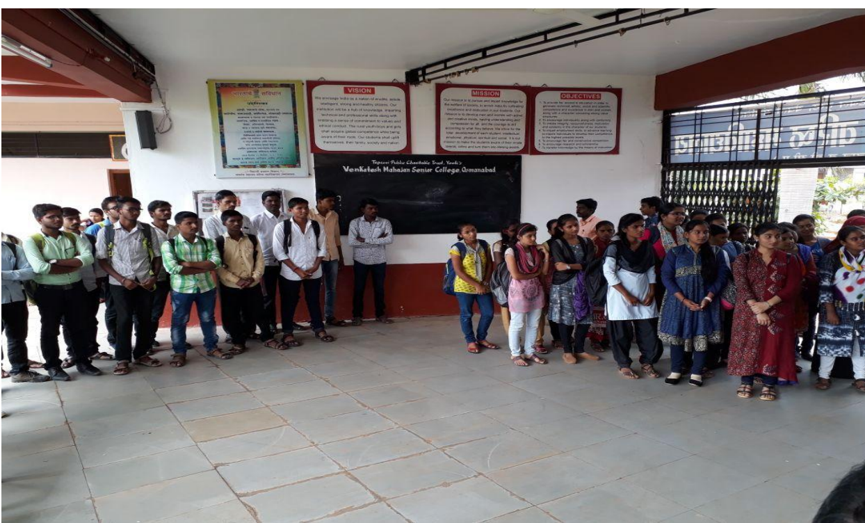
All staff members and Students