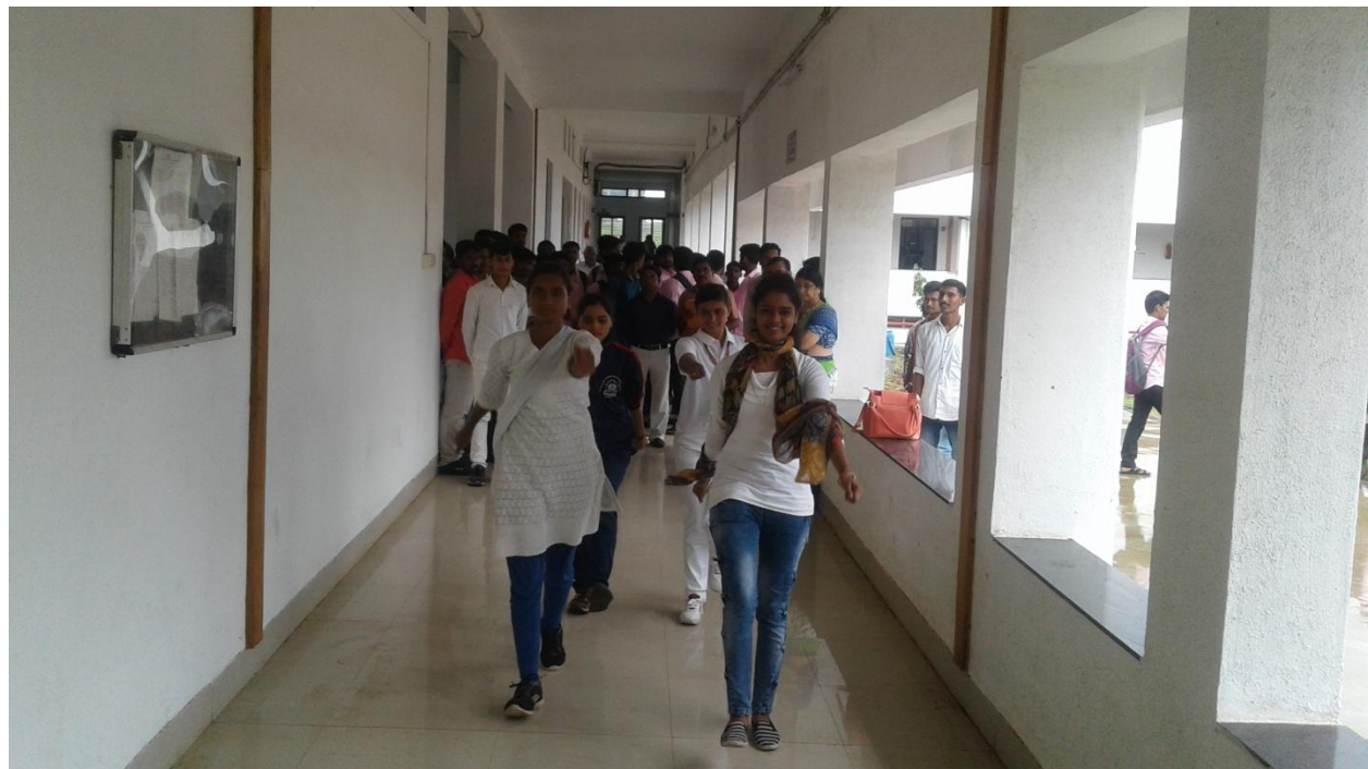
SRD/NRD Selection Camp –participated Volunteers