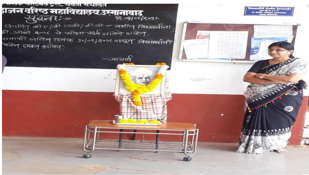
Teacher's day Celebrated by students and staff