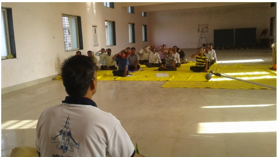
Yoga by al Staff member and students