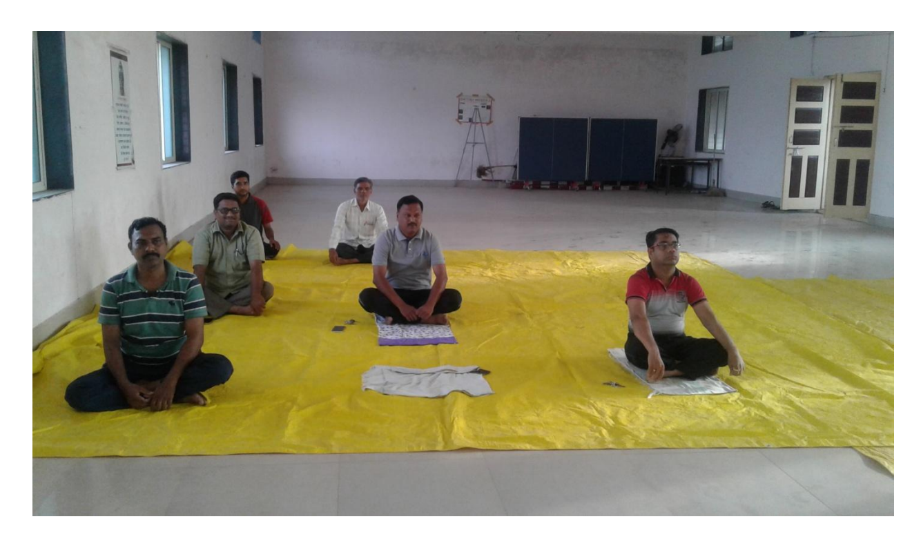
Yoga by al Staff member and students