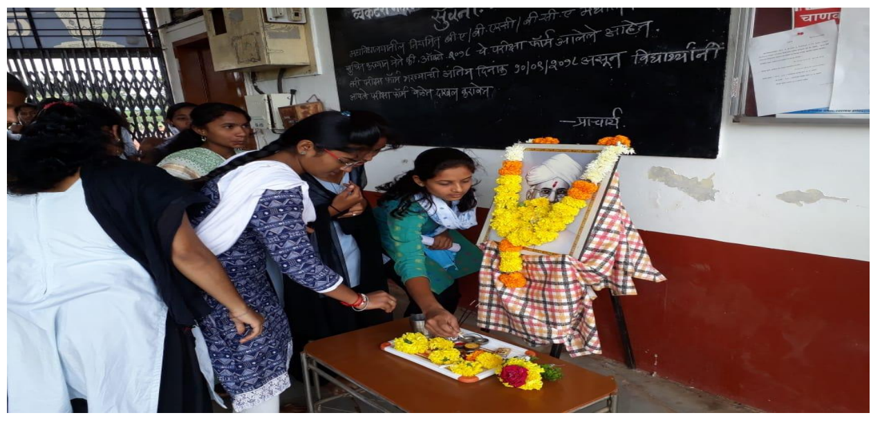
Teacher's day Celebrated by students and staff