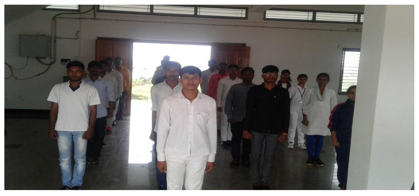
SRD/NRD Selection Camp –participated Volunteers