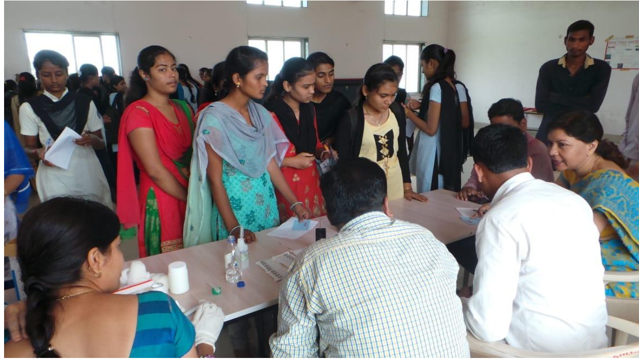
Health Checkup camp