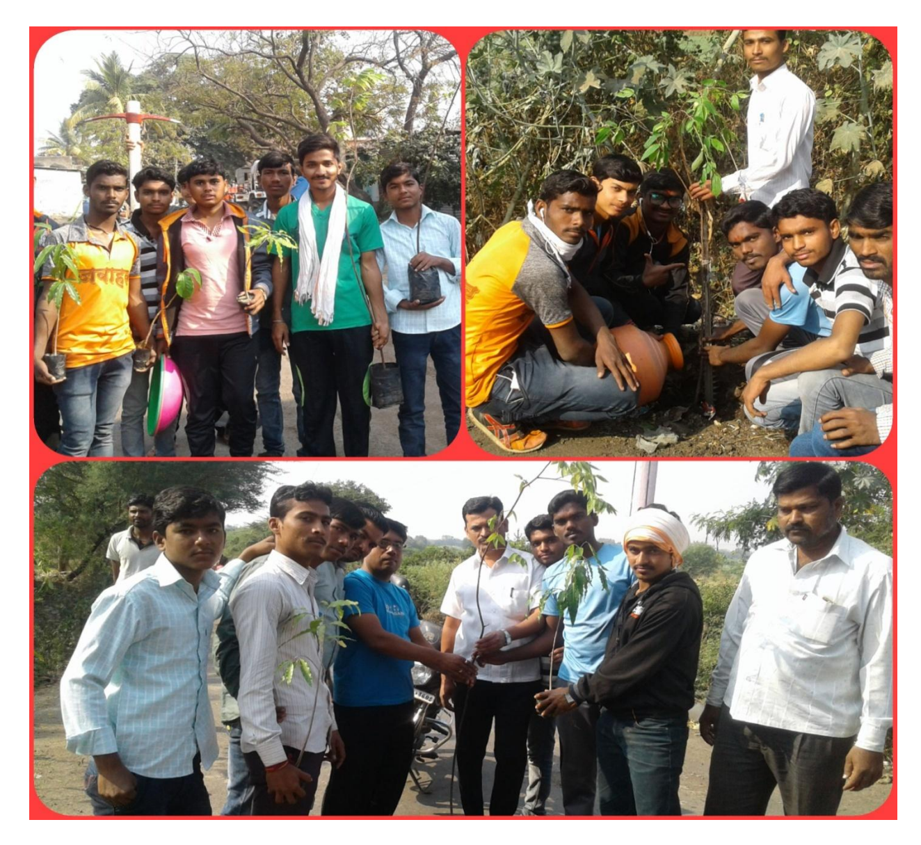
Tree Plantation by students, staff and villagers